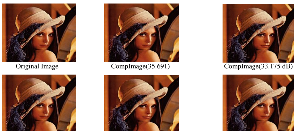
Figure (3) shows some samples of the decompressed images, it obvious that the subjective image quality is preserved.