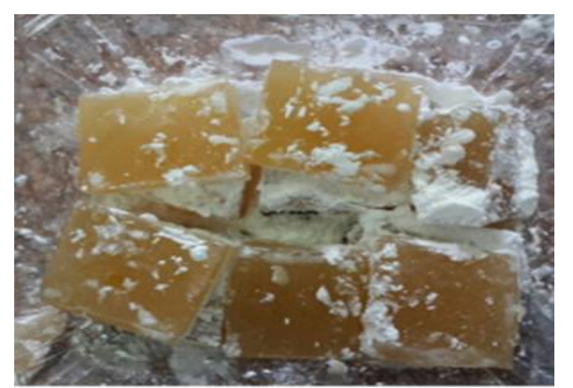
Figure 2. Functional delight supplemented with different levels of 15 mg extract

A stock solution of clementine peels was prepared by dissolving 1500 mg of crude extract in 10 ml of corn oil. The delight was prepared by using a formula consisting of 100g sucrose, 11.7 g corn starch, 12 g gelatin, 103 ml of water, and the crude extract was added at the end of cooking at levels 25, 50, 75, and 100 µl (based on preliminary experiments) to obtained 3.75, 7.50, 11.25 and 15 mg astaxanthin. 100 g of granulated sucrose was poured into the cooker with 37 ml cold water while stirring and the temperature was raised to boiling. starch (11.7 Then, g) was dissolved in approximately 35 ml of cold water and added to the previous sugar mixture. Moreover, gelatin was dissolved in 31 ml warm water and added to the mixture. At the end of cooking (10-15min) the crude extract was added as mentioned before. All of the delights were spread on trays covered with corn starch, left sitting for 24 h at room temperature and samples were cut by a knife and then delight samples were packed in polyethylene bags and stored at room temperature until further analysis (Fig.2).