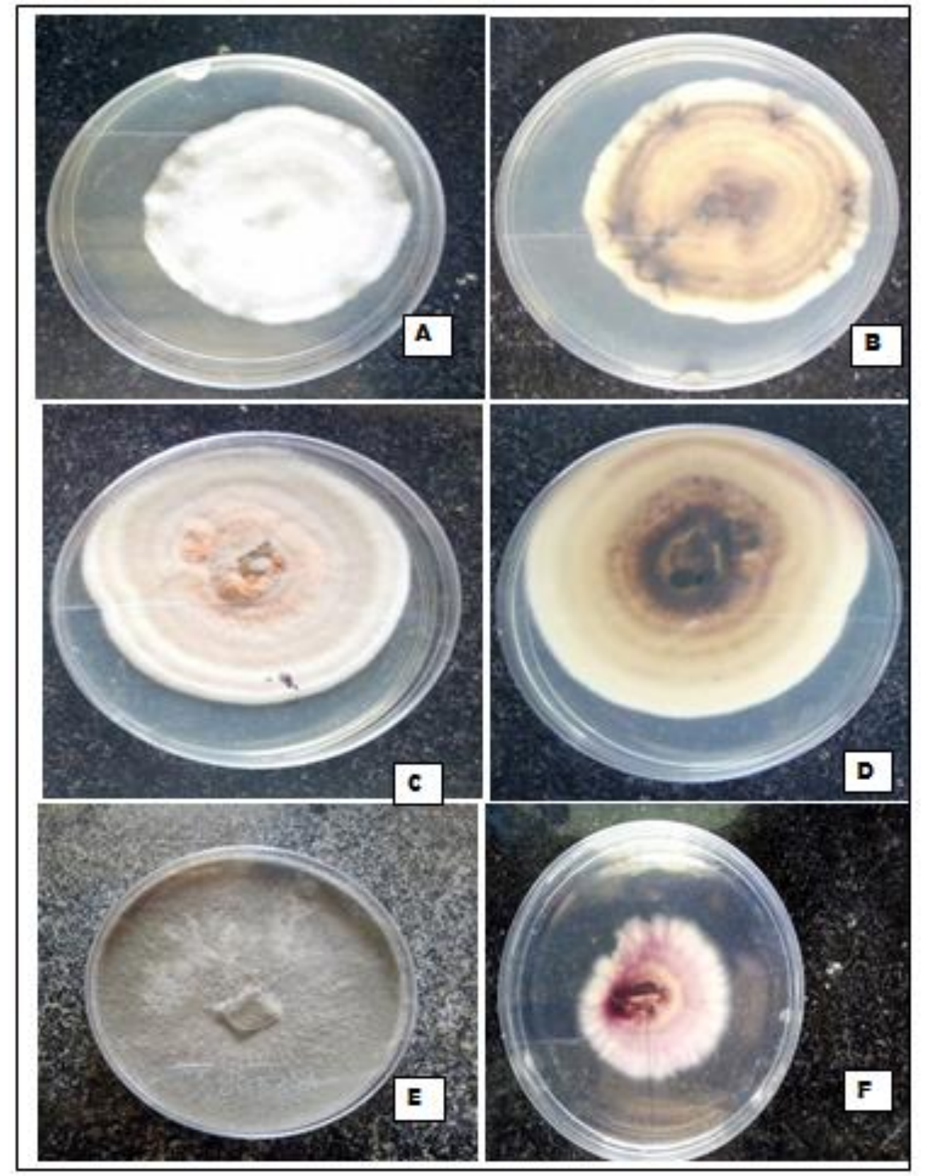
Figure 3. Morphology of the isolated fungal isolates A. Front view of Curvularia geniculata B. Reverse view of Curvularia geniculata C. Front view of Epicoccum sorghinum D. Reverse view of Epicoccum sorghinum E. Daldinia eschscholtzii F. Fusarium sp.

phaseolina, Arthrinium arundinis, Daldinia loculata, Chaetomium globosum and Phomopsis azadirachtae Fig. 3. However, only Fusarium sp. was unable to be identified to species level.