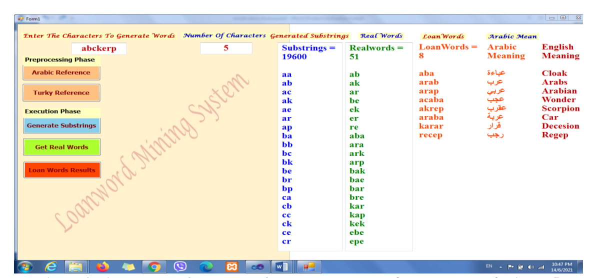
Figure 4. First sample of loanwords for the character set {a, b, c, k, e, r, p} with n=5

Then the system was tested for extracting all the loanwords that range in a specific length with a predefined character set. Many tests were done for different character sets and different word lengths. The entire outputs were checked manually. Two samples of these tests are shown in (Figs. 4, 5). The first step is entering any set of characters and the maximum length of the generated substrings. Then the button "Generate Substrings" needs to be pressed. This will extract all real words in this range by traversing the graph which represents the entered set of characters.