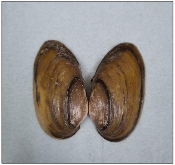
Figure 1. Unio tigridis morphological view.

Baghdad Science Journal 2024, 21(1): 53-61