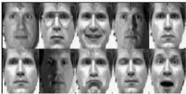
(b) YALE Dataset