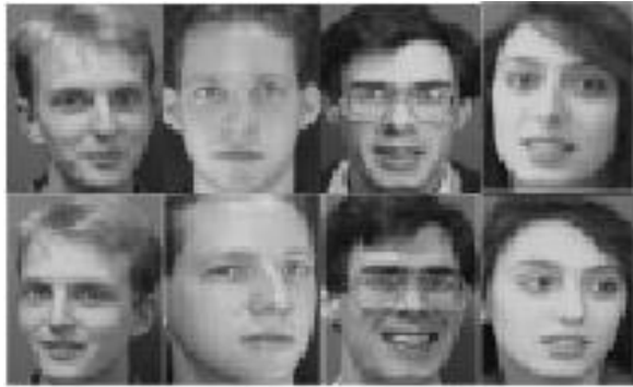
(a) ORL Dataset