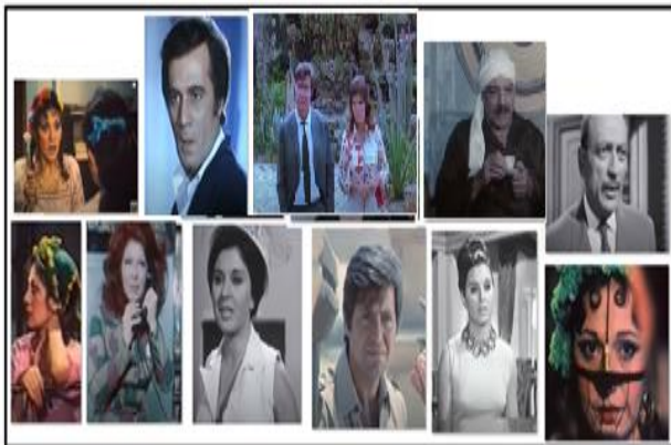
Figure 2. Sample images from AAD.

Also, the images taken from various movies, including black and white, and color ones (old and new movies). Additionally, there are images depicting complete scenes, while others capture only partial scenes. Moreover, as far as current knowledge indicates, there exists no dedicated dataset for images sourced from Arab films. The Arabic Actors Dataset (AAD) was conceived and developed, employing an 82/18 split ratio for the training and testing sets. Sample images from AAD are illustrated in Fig. 2.