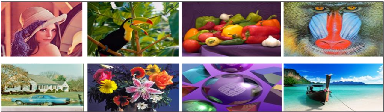
Figure 2. The input images used to evaluate the propose algorithm.

used as test images, which are Lena, Bird, Peppers, Baboons, Car, Flowers, Colors and Wallpaper to ensure the findings of the experiments. As seen in Fig. 2.