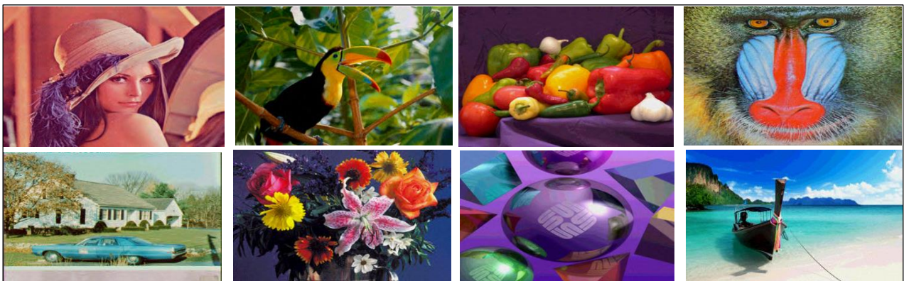
Figure 3. The output decompressed images.

coefficients consists of three values, each value used to quantize different color space (y, cb, and cr), respectively. See Fig. 3 which shows the output decompressed images obtained from the proposed system.