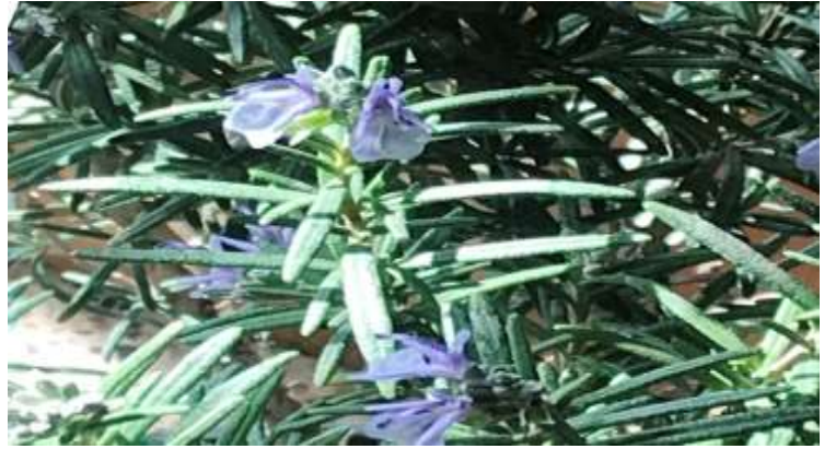
Figure 1. Rosemary plant (shoots and flowers).

negatively on plant growth, development and production. It was reported that water deficit altered the morphology of rosemary plants, reduced growth parameters, oil yield, and photosynthetic productivity <sup>9,10</sup>.